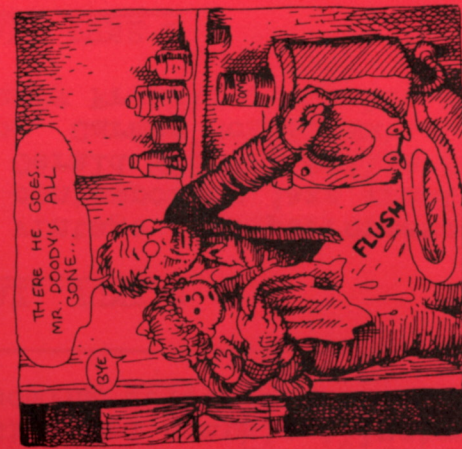
"R. CRUMB: MR. SKETCHUM"