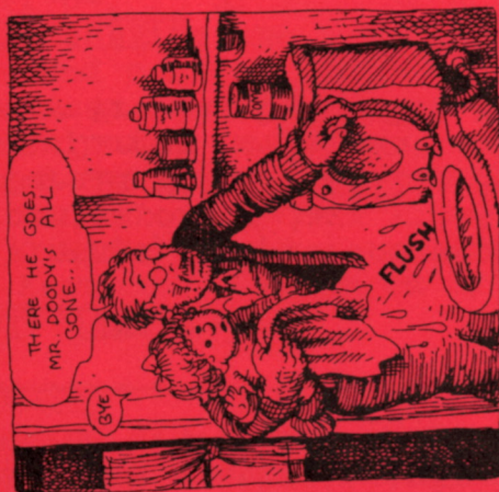
"R. CRUMB: MR. SKETCHUM"