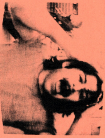
CASE OF THE MISSING CONSCIOUSNESS