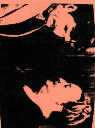
FACULTY WIVES, PART 3

A documentary look at the street people who perform at Venice Beach, produced by Mark Shepherd.