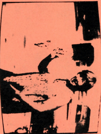
ROSE OF THE DESERT